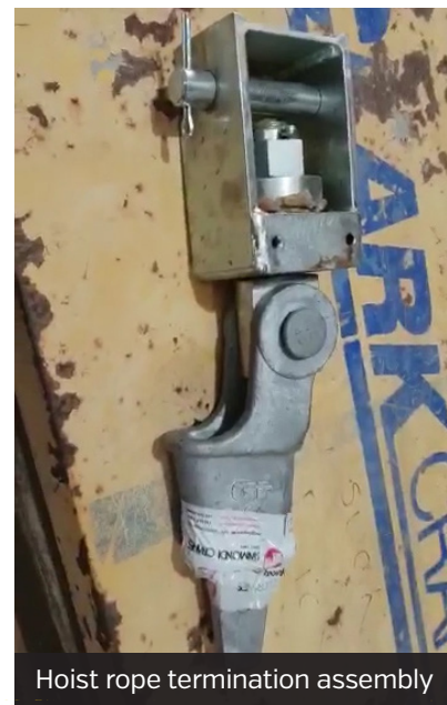
Hoist rope termination assembly

Safety is union business. Stand up. Speak out. Come home.