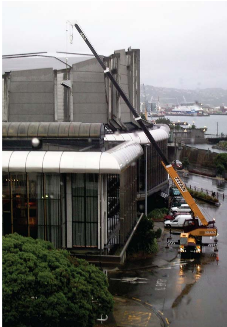
A Titan Crane swings equipment into place over the Wellington Town Hall - wild wind and rain no problem.

Some members were late to update the latest Crane Register. Their details are still available to anyone wanting to find the right firm for a lifting job. The Association's web site carries a location map of members with links leading to their equipment and company details. Any member with information missing from the Register can certainly be updated on the web site.