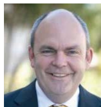
Transport Minister, Steven Joyce

The government says it will legislate changes next year.