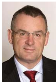
Hon. Trevor Mallard, Minister of Labour.

We have managed to arrange meetings with the Hon. Trevor Mallard, Minister of Labour and Harry Duynhoven,